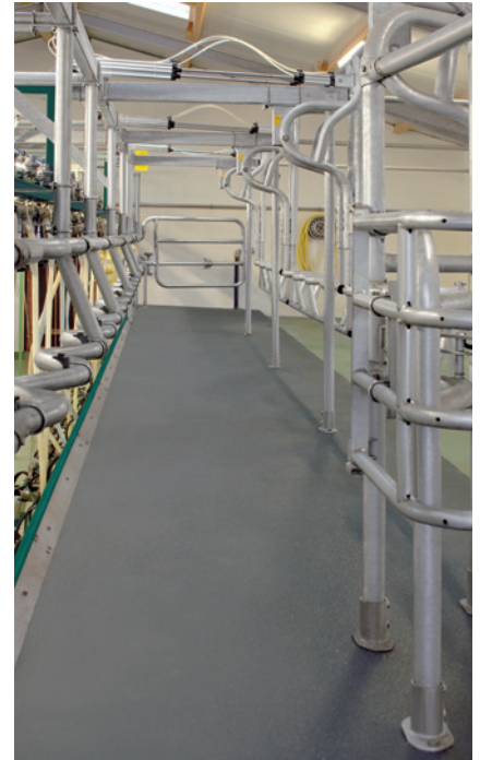
Wide passageway for rapid entry