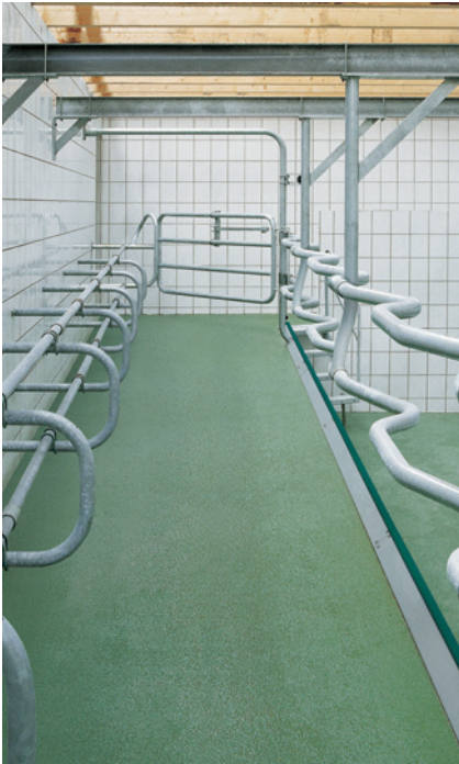
Animal-friendly entry and exit gates actively support the positioning of the first and last cow